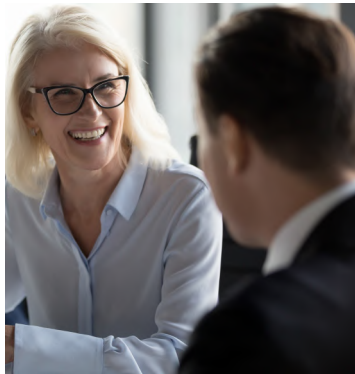
Boosting face-to-face conversations (hearing enhancement)