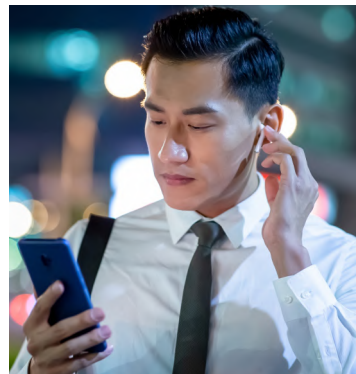
Enhancing voice clarity for TWS and headphones