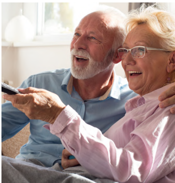
Improving voice intelligibility in movies and TV programs