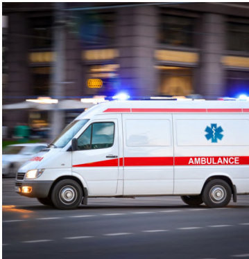
Automotive ambient sound acquisition without microphones