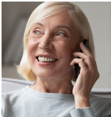
Slowing down speech in real time for better comprehension