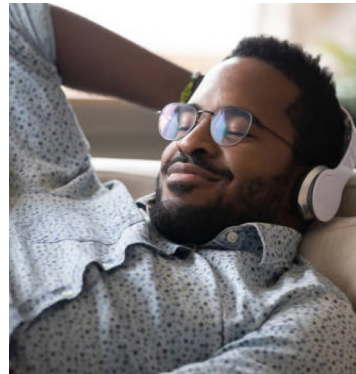
Audio augmented for user's unique hearing profile